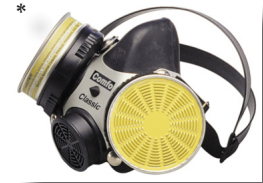
MSA™ COMFO CLASSIC RESPIRATOR HALF MASK